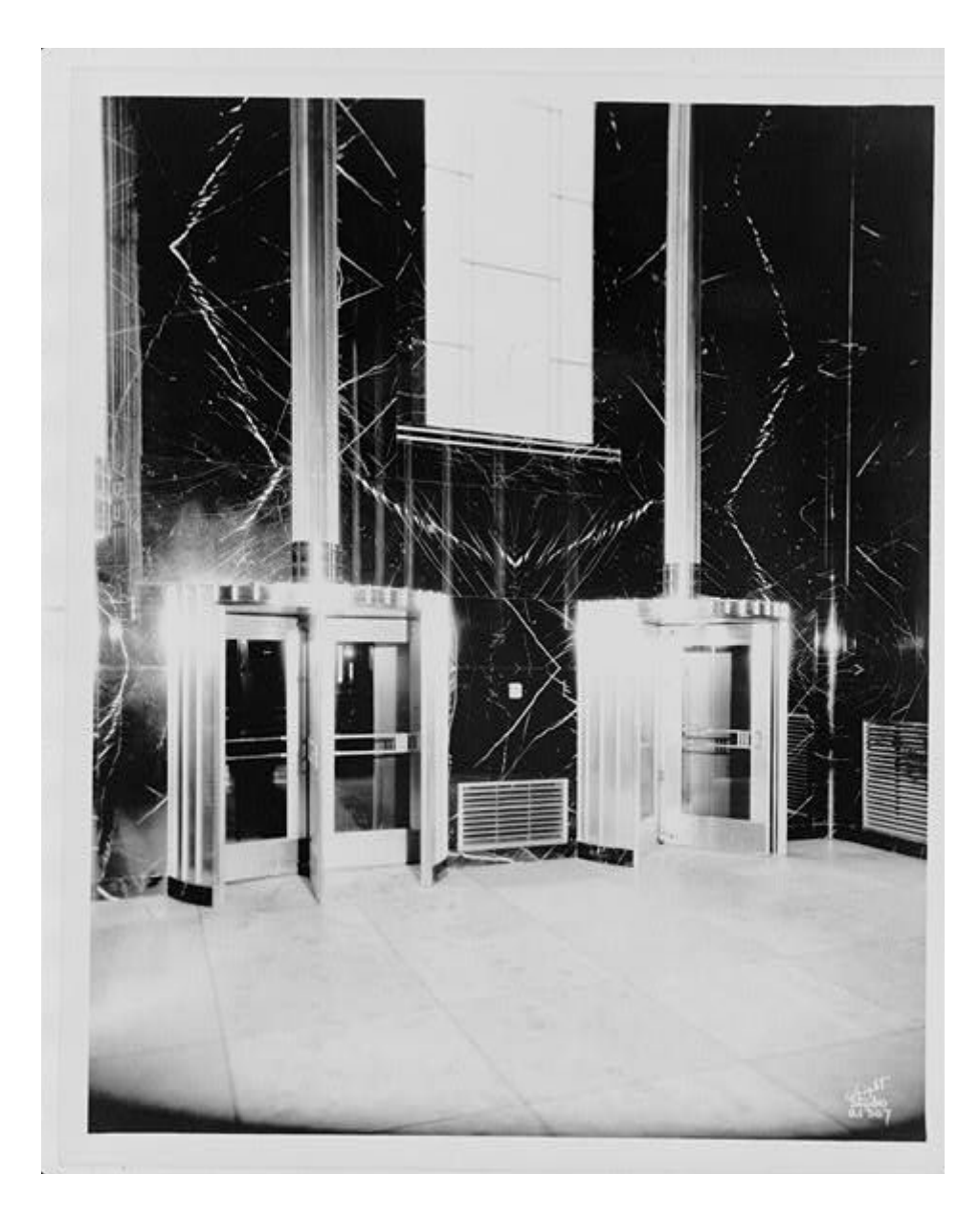
Revolving door entrance to Memorial Hall.