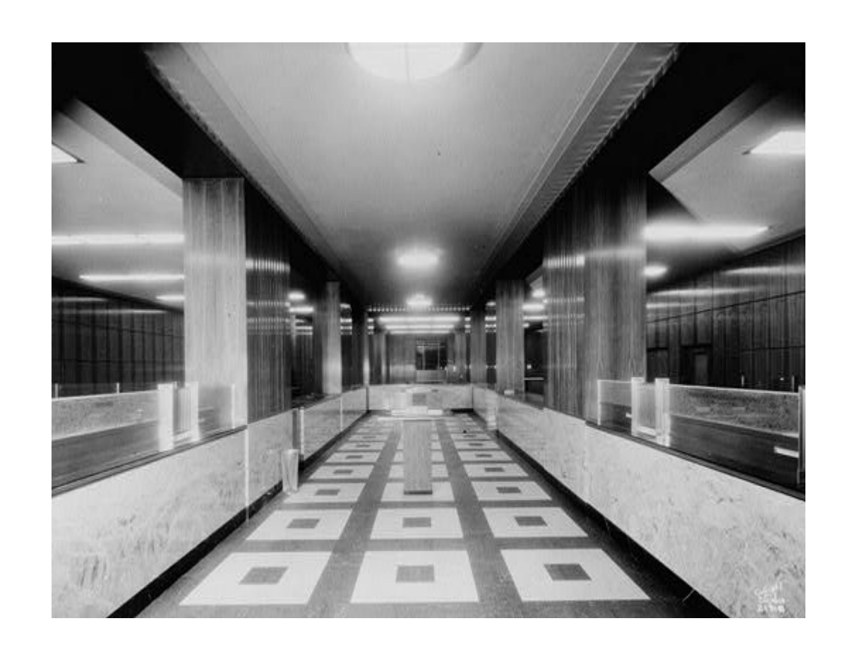
Department of Finance.