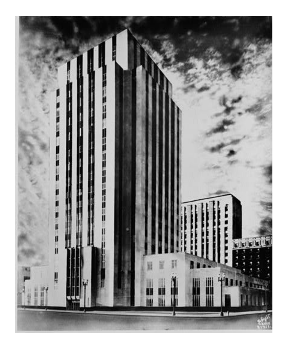
Photocopy of drawing, delineator not identified, but probably Ellerbe & Company. (ca. 1931)