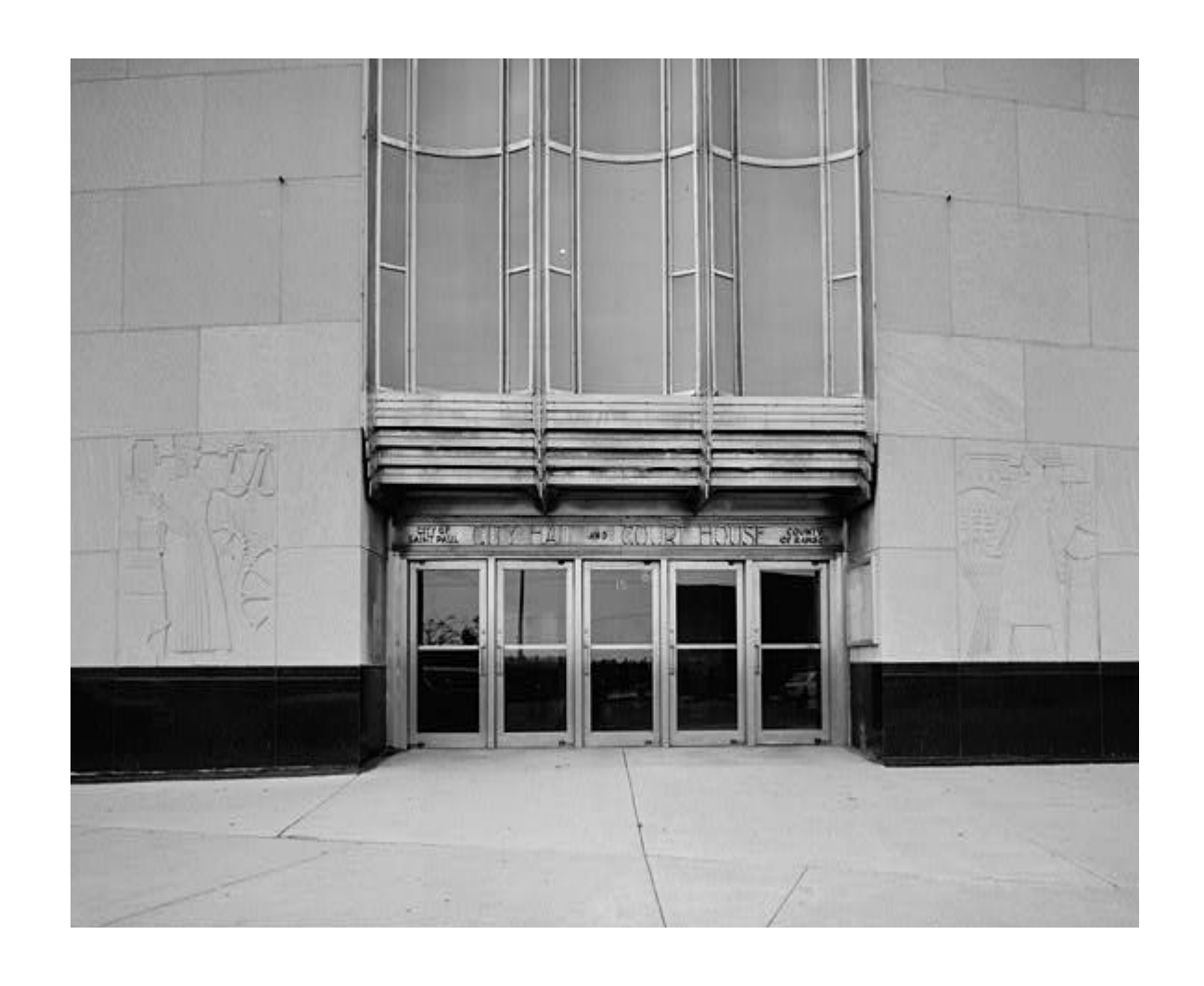
West Kellogg Boulevard entrance.