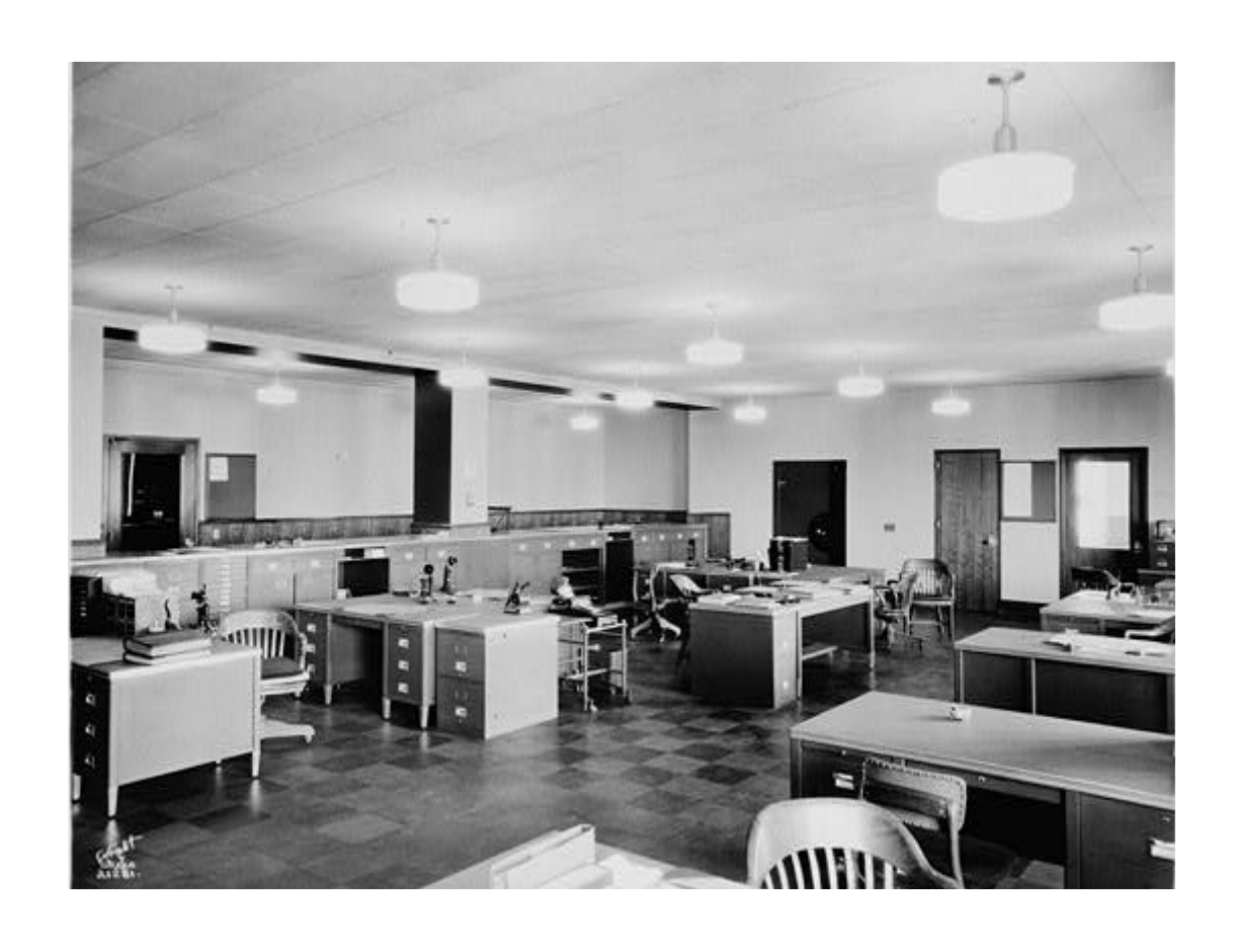
Offices of the Clerk of Municipal Court.