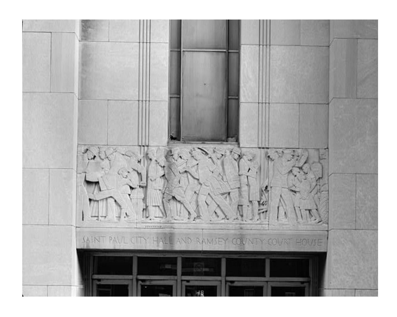
Detail of relief by sculptor Lee Lawrie, Fourth Street entrance. (ca. 1932)