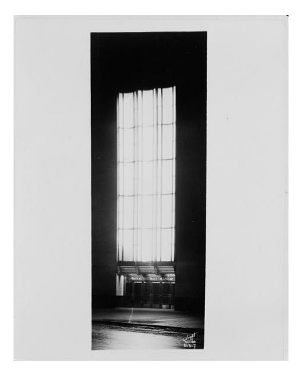
West Kellogg Boulevard entrance.