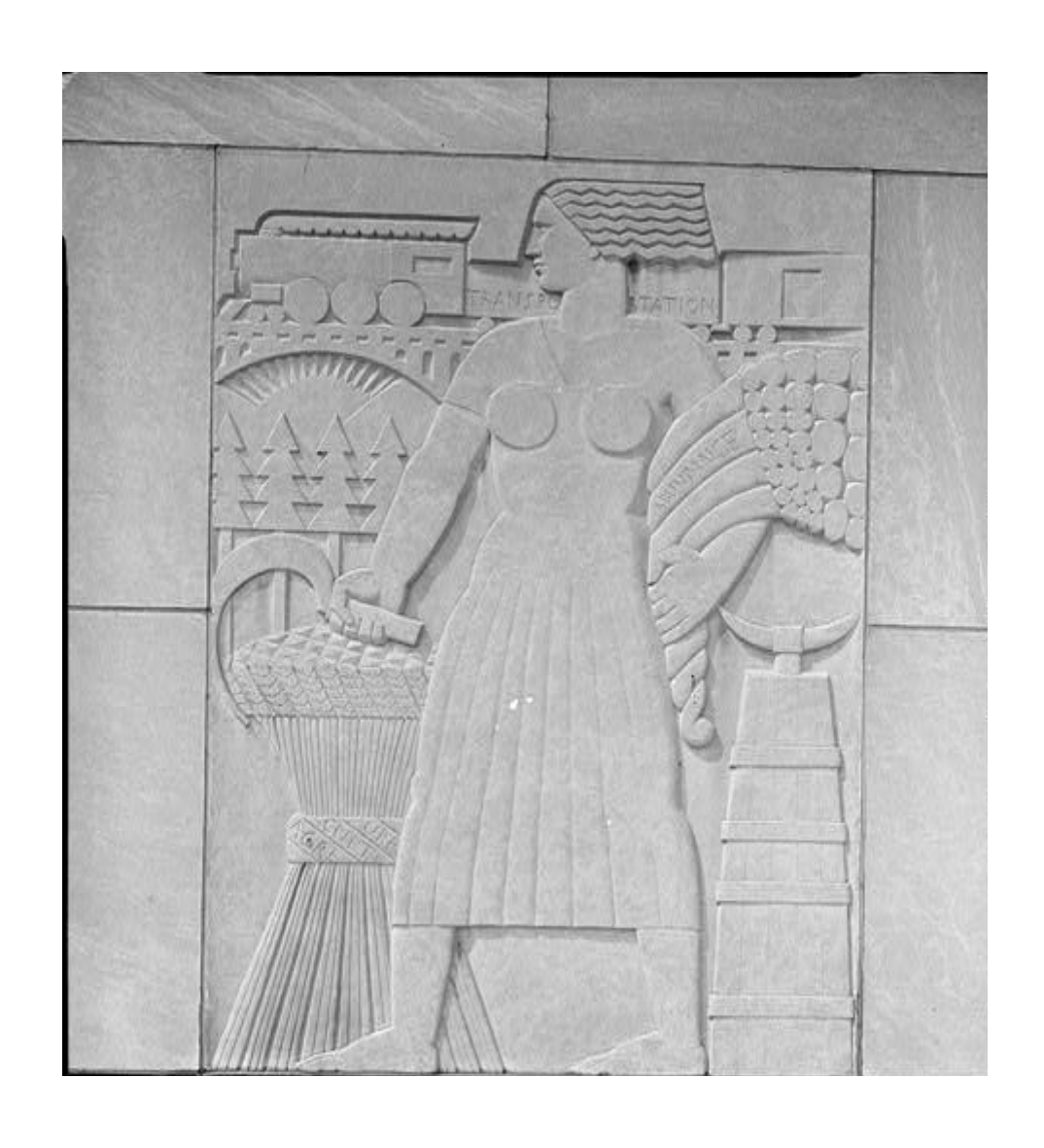
Detail of relief by sculptor Lee Lawrie, West Kellogg Boulevard entrance. (ca. 1932)