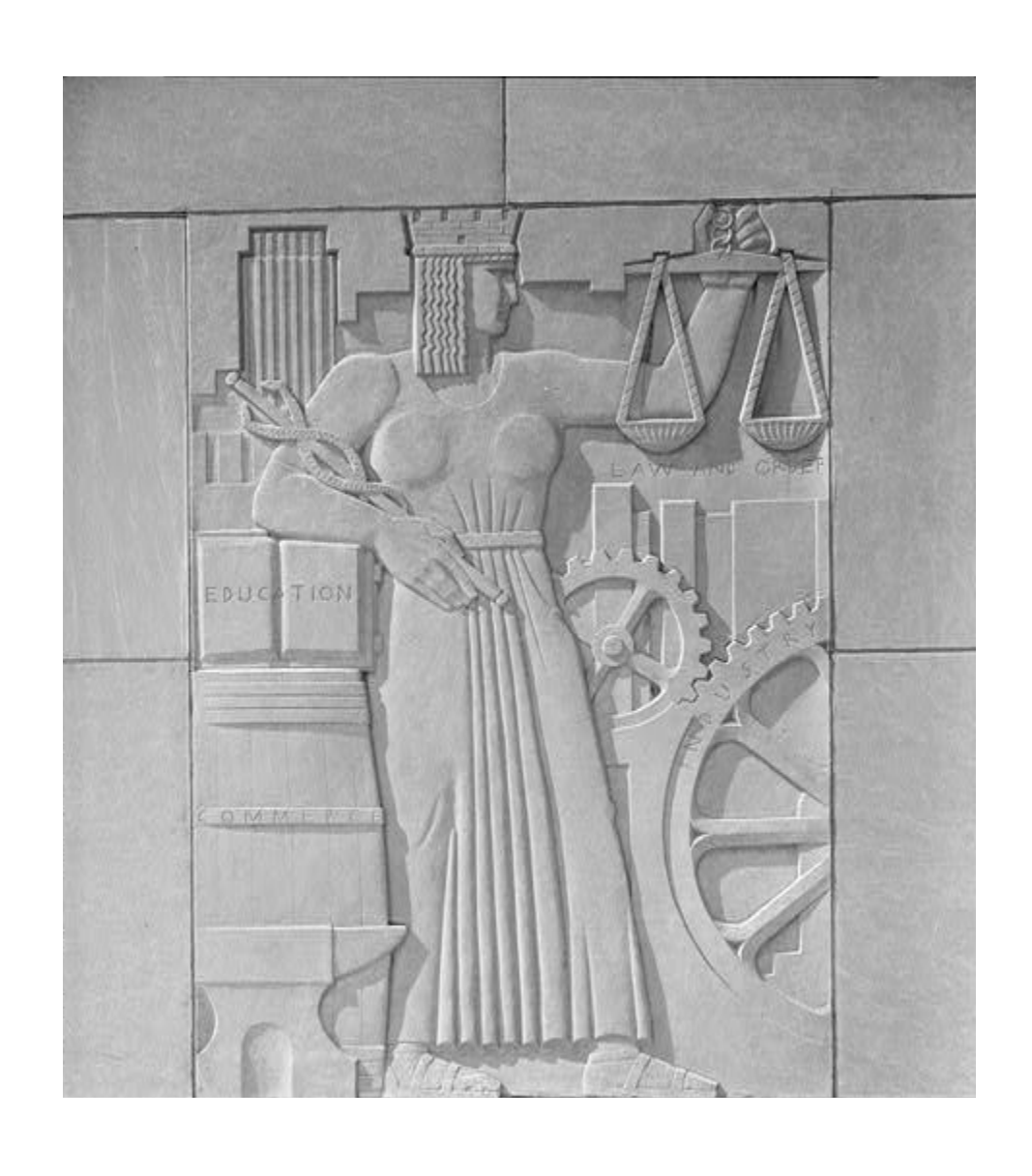
Detail of relief by sculptor Lee Lawrie, West Kellogg Boulevard entrance. (ca. 1932)