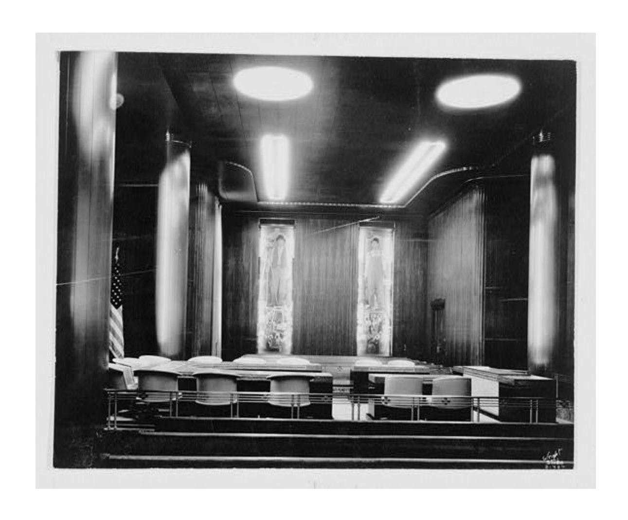
Chambers of the St. Paul City Council.