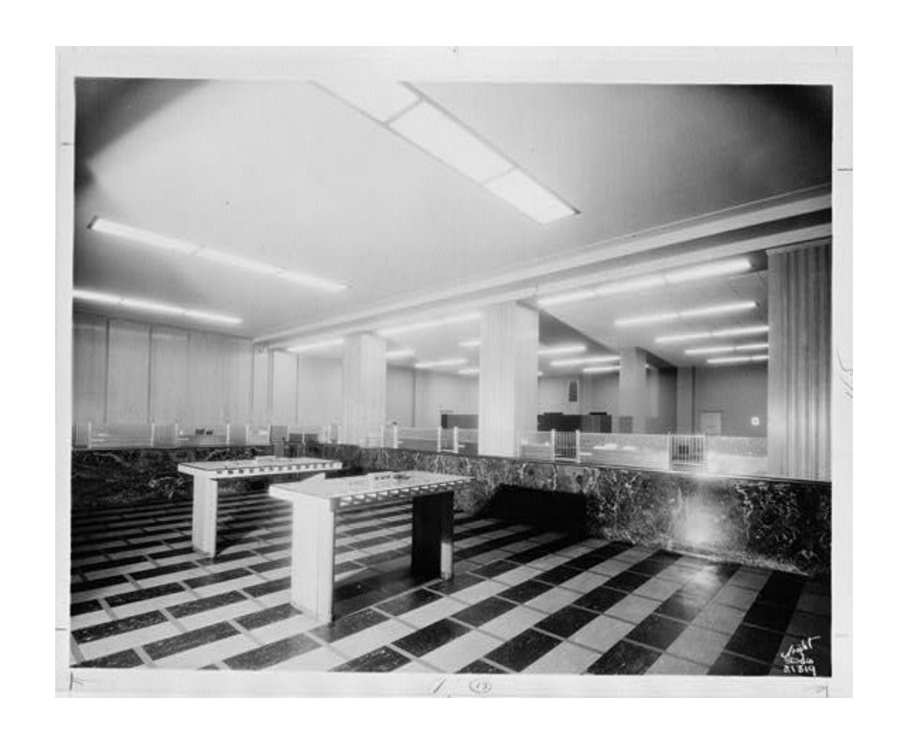
Offices of County Treasurer.