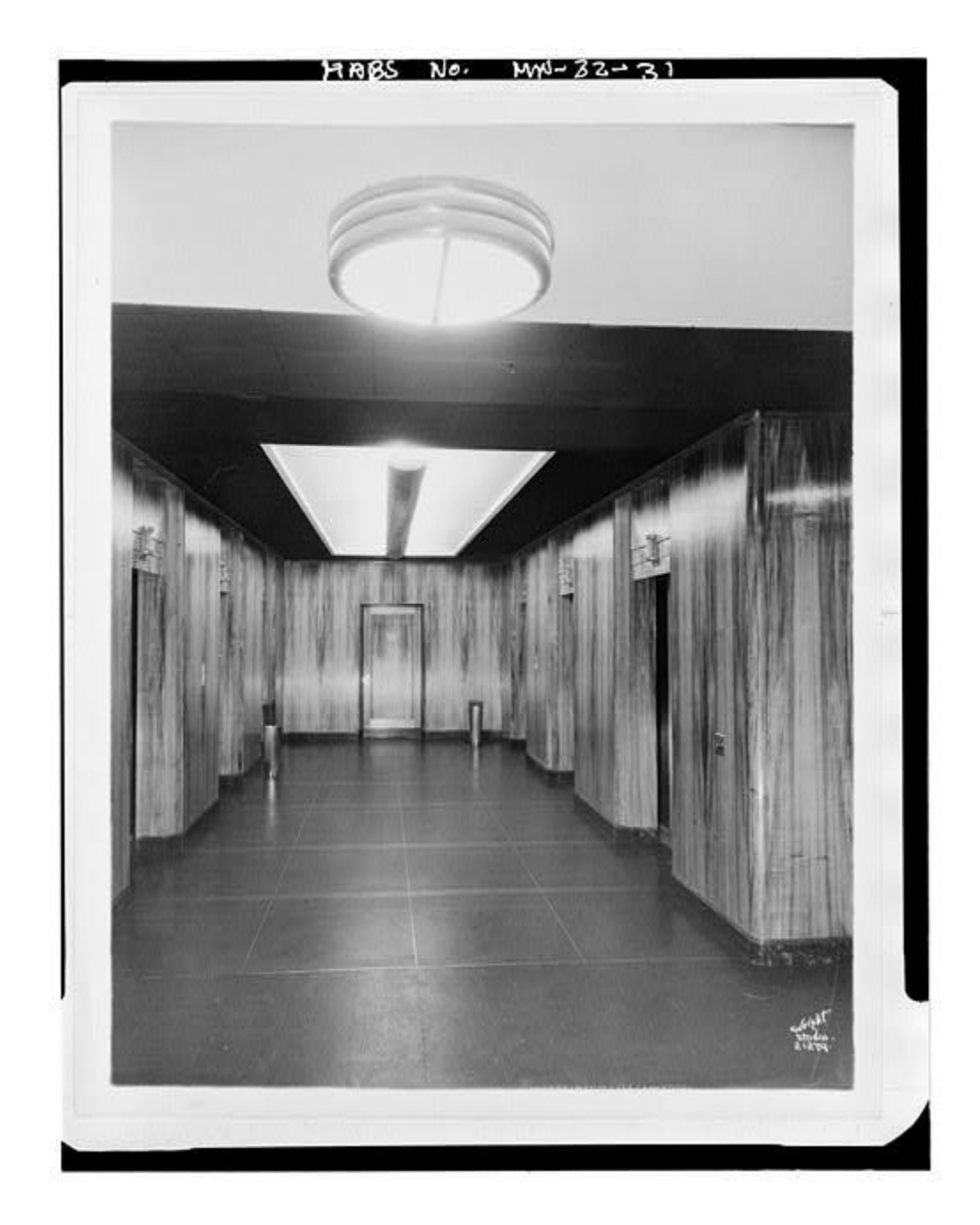
Elevators on upper level lobby, with circular ceiling light in foreground.