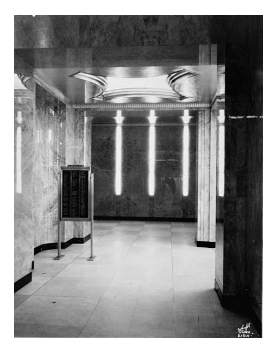
Lobby, first floor.