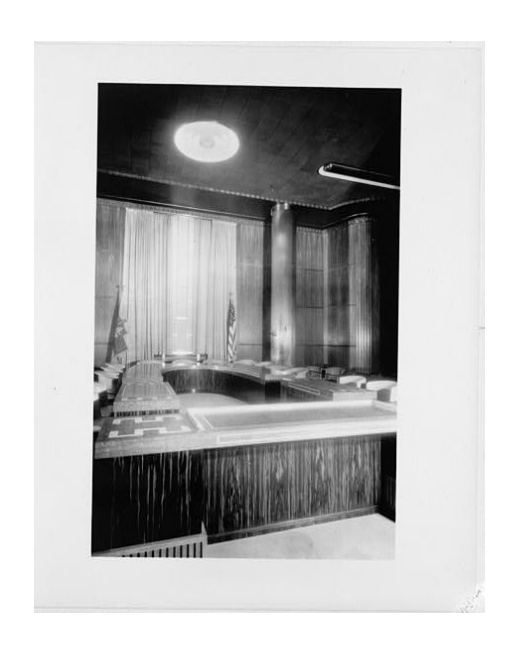
City Council Chambers.