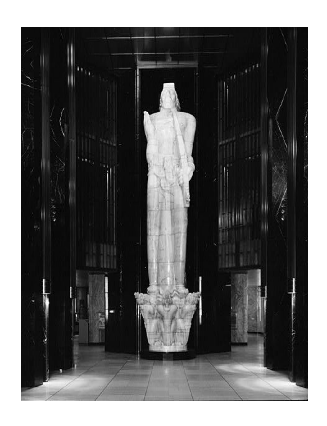
Indian God of Peace, by Swedish sculptor Carl Milles, at end of Memorial Hall.