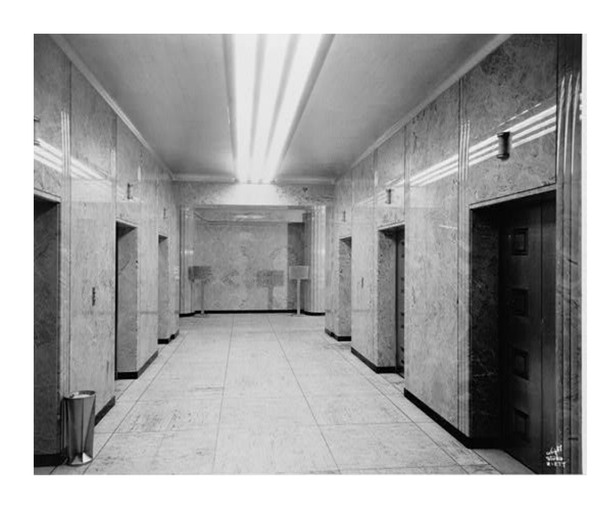
Elevators on upper level lobby.