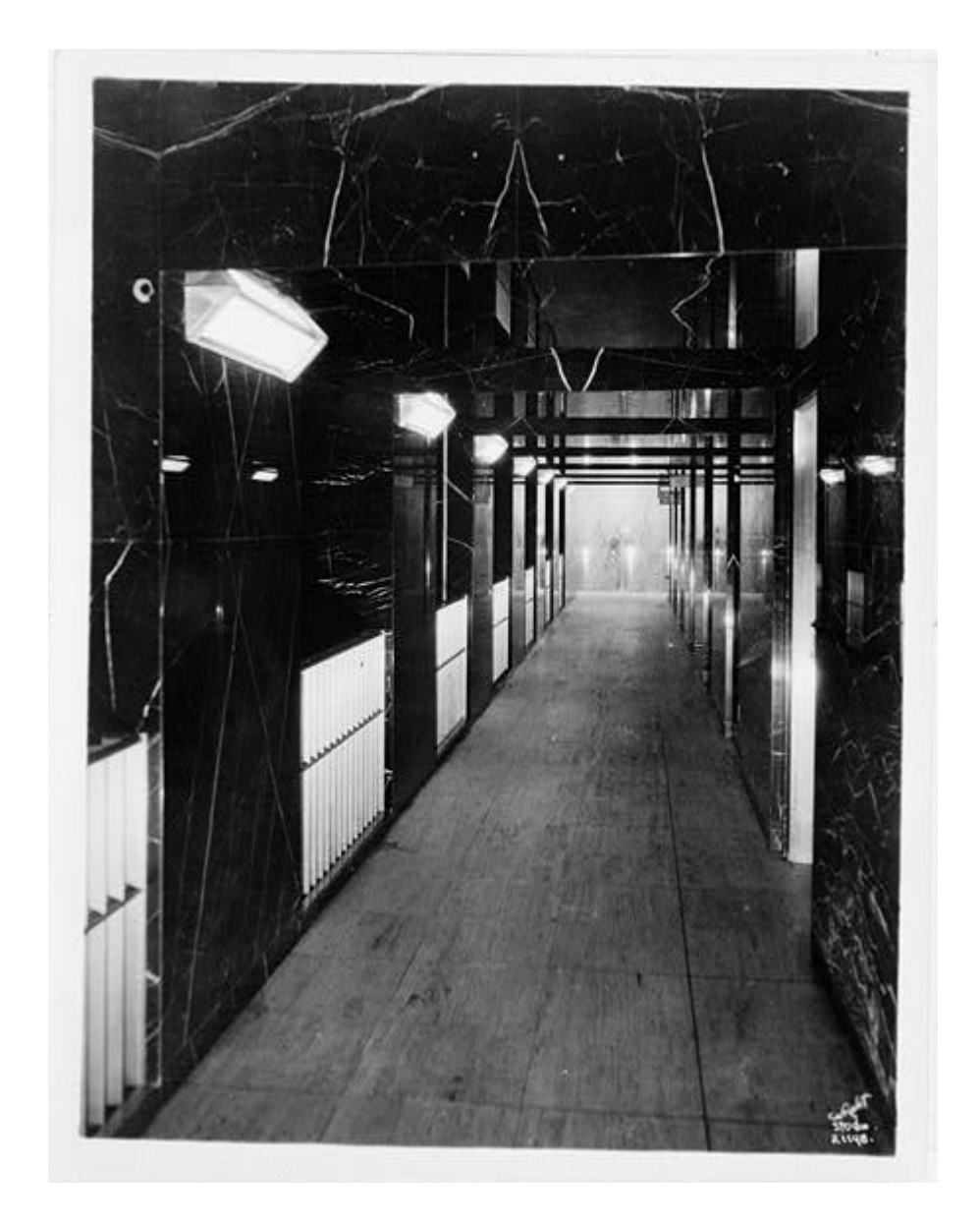
Memorial Hall gallery.