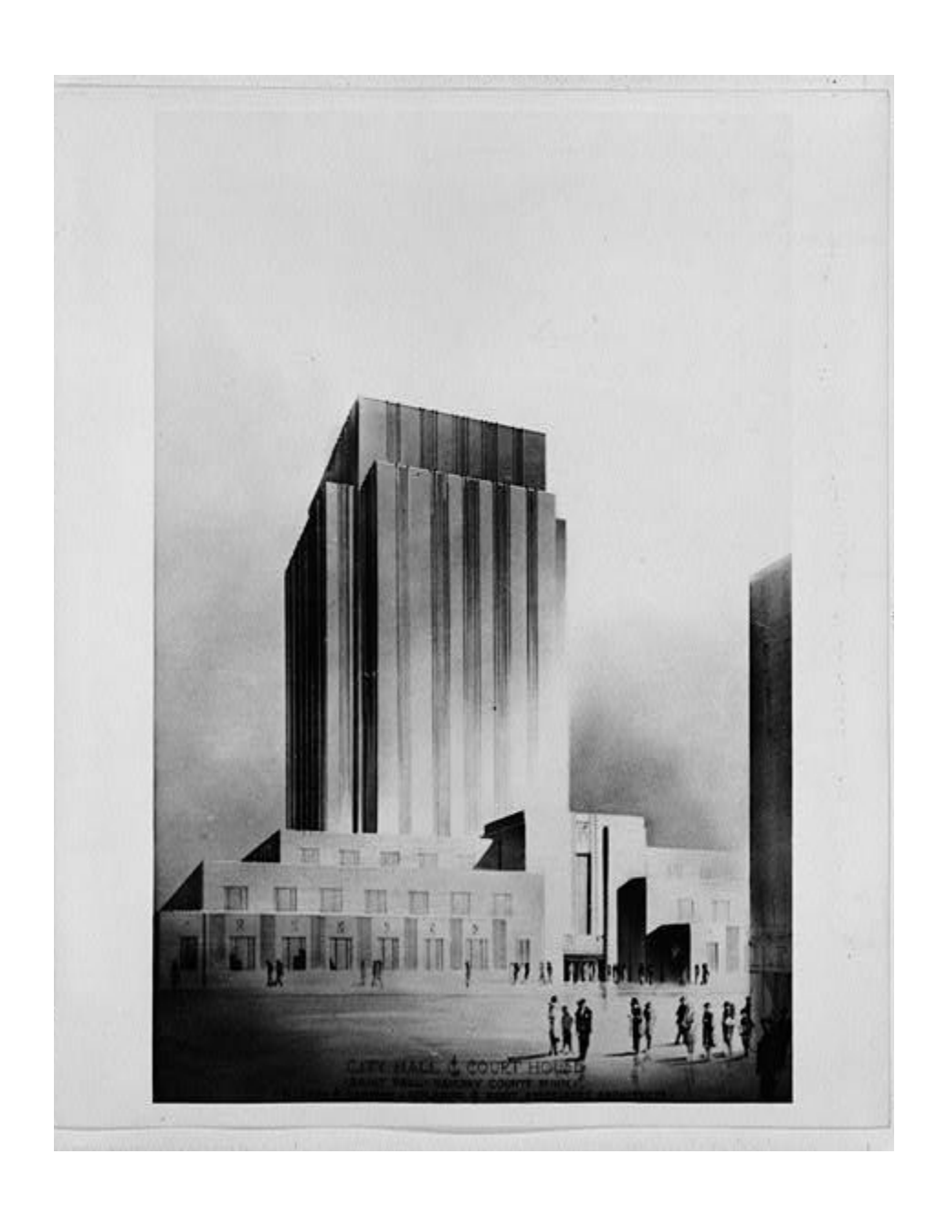
Photocopy of drawing by Ellerbe & Company, one of the architectural firms. (ca. 1930)