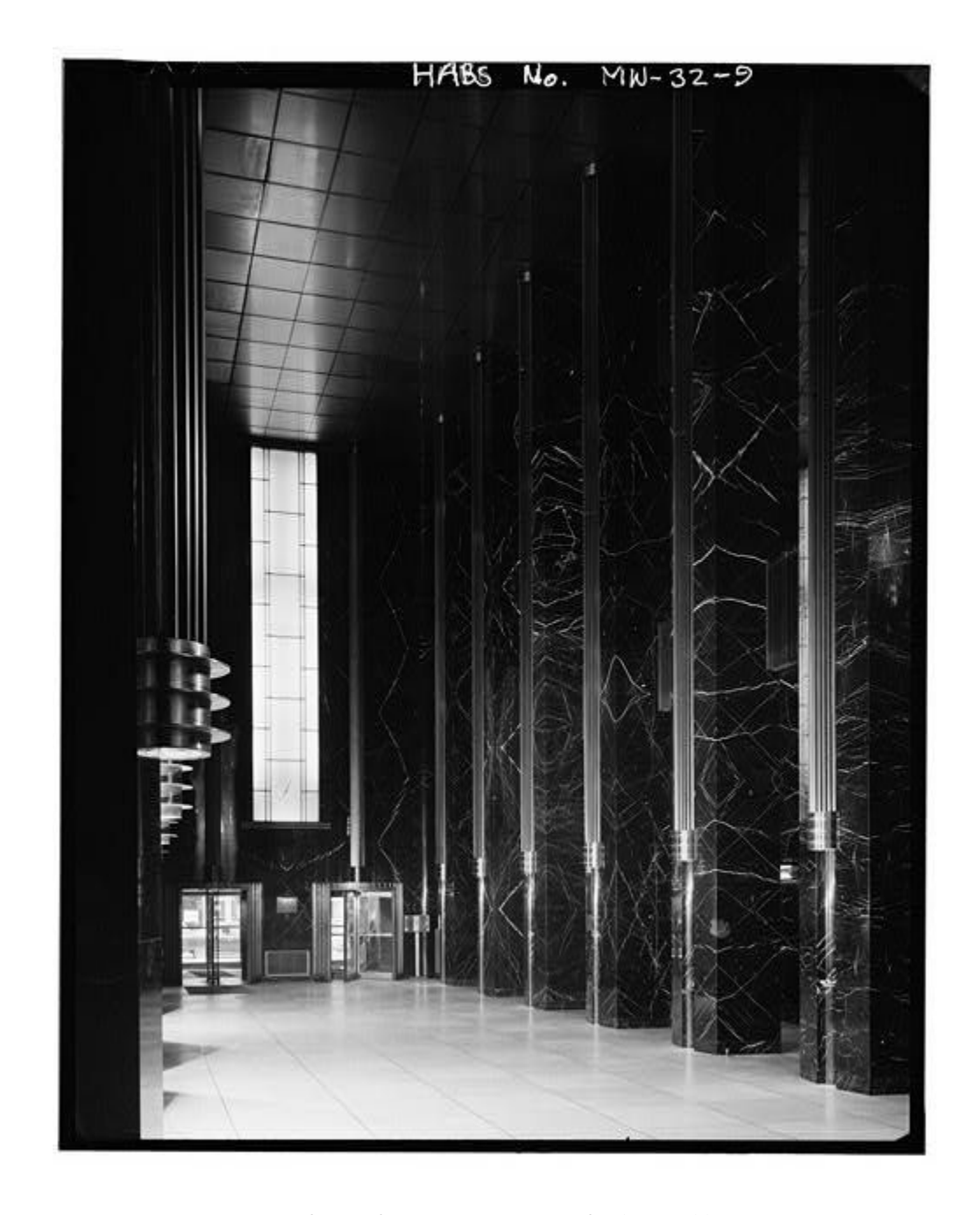
View from Memorial Hall to entrance on West Kellogg Boulevard.